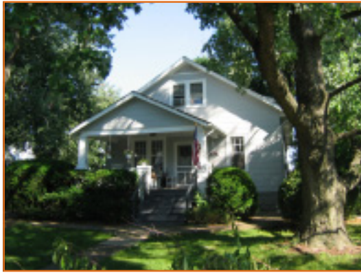
Arlington: Quintessential bungalow 5BR, 4BA – not yet priced