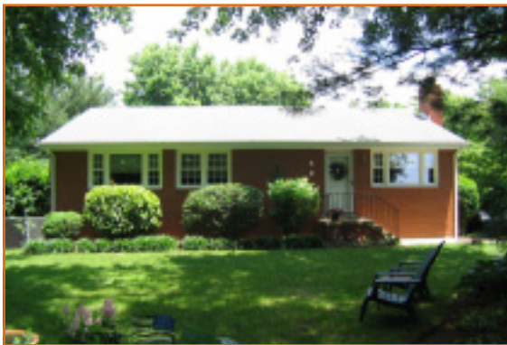
Falls Church: Brick rambler on W&OD trail – 4BR 3BA mid $600's